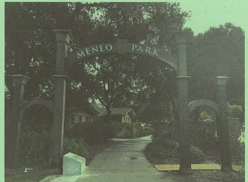
Menlo Gates 2019