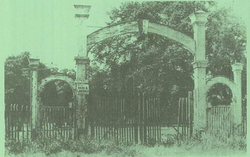
Menlo Gates ca 1900. The Gates were located on the west side of El Camino Real approximately 500 feet south of Santa Cruz Avenue