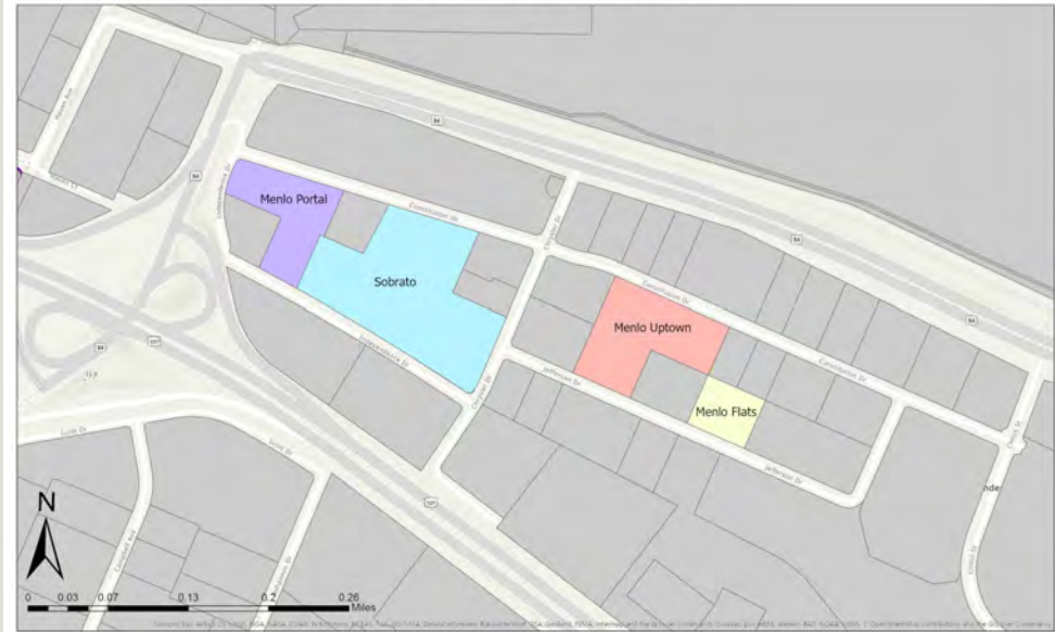
SB 330 Preliminary Applications