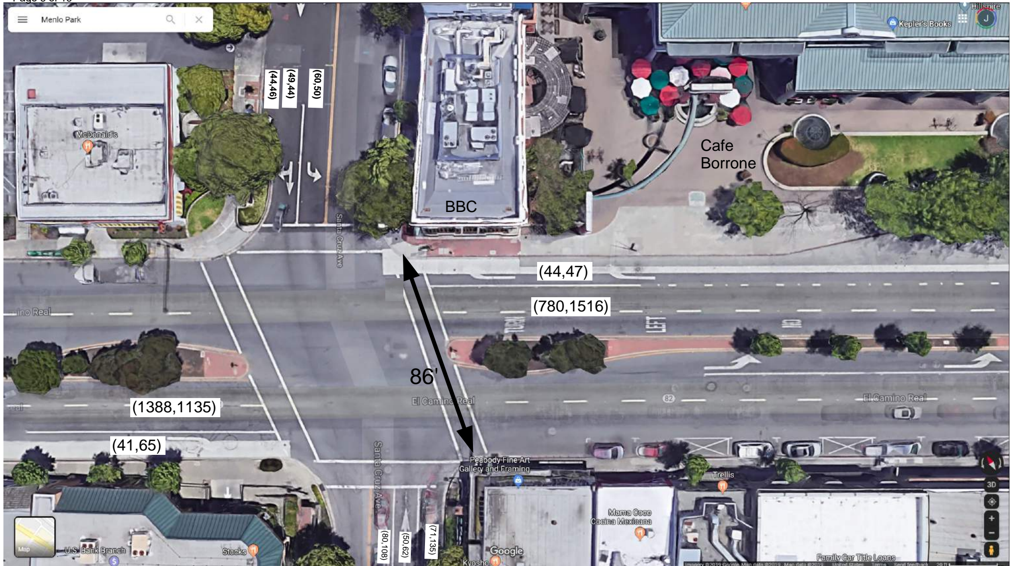
Turn lanes are underutilized. Read lane volumes as (AM peak hour cars, PM peak hour cars)