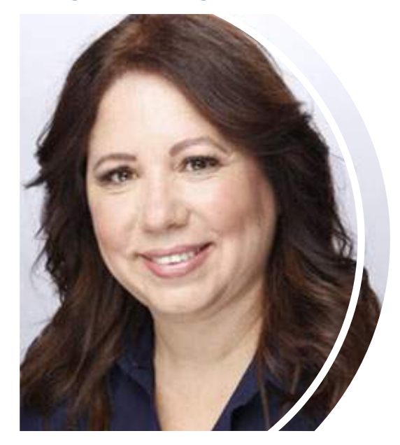
President of GEOinovo Solutions GEOINOVO