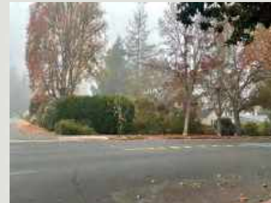
At Millie Avenue