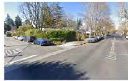
At Millie Avenue