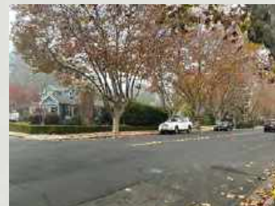
At Rose Avenue