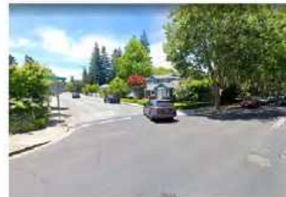
At Rose Avenue

Locations: intersection of University Drive/Millie Avenue and intersection of University Drive/Rose Avenue