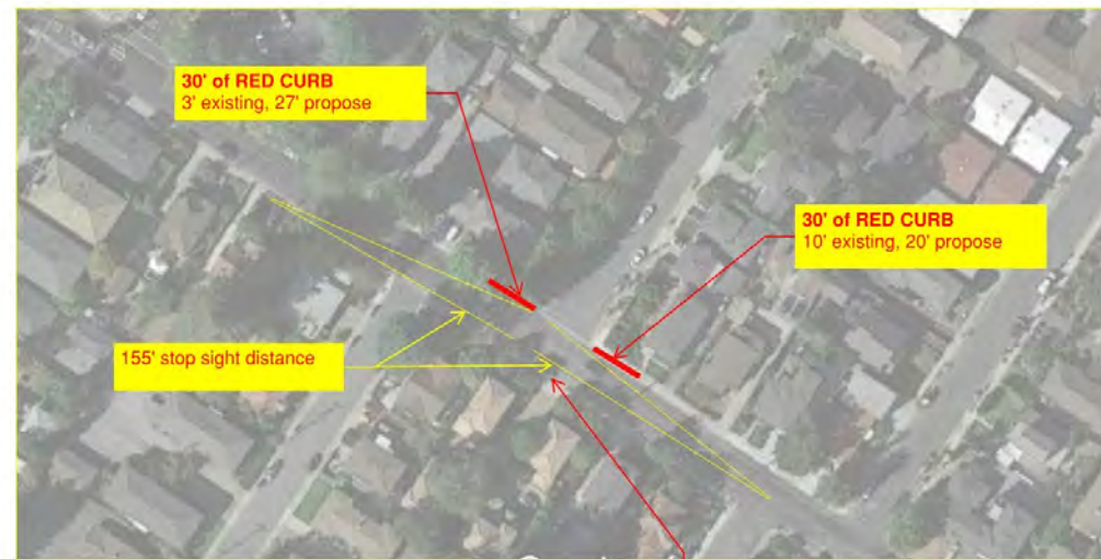
Intersection of University Drive and Live Oak Avenue

Extend 27' of additional red curb (on the north side)