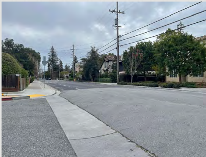
Looking left at 3' beyond the Stop bar

Inadequate line of sight as drivers turn onto University Drive from Live Oak Avenue