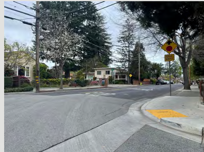
Looking right at 3' beyond the Stop bar