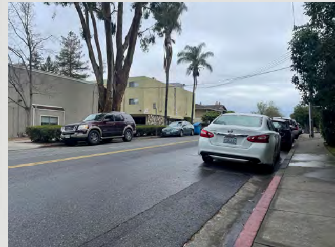
Looking right at 3' beyond the edge of the driveway