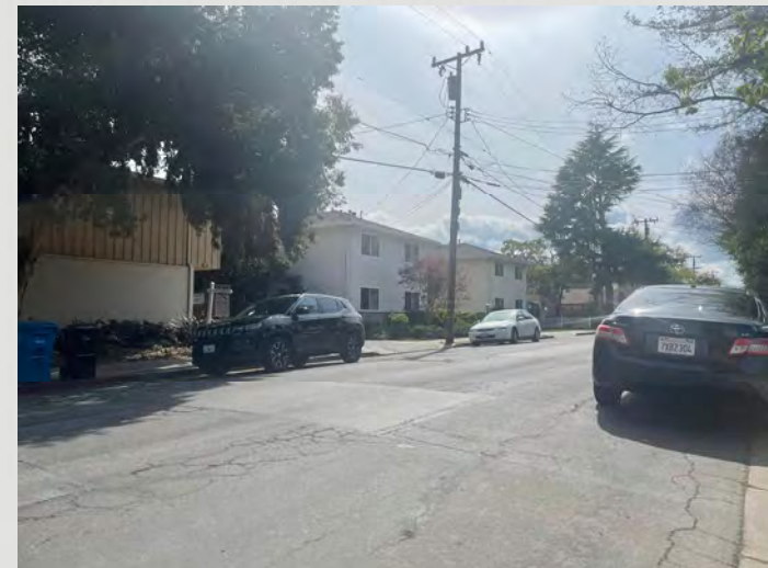
Looking right at 3' beyond the edge of the driveway