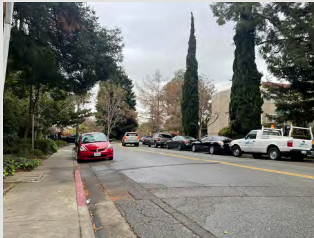
Looking left at 3' beyond the edge of the driveway

Inadequate line of sight as drivers turn onto O'Keefe Street when they exiting the driveway