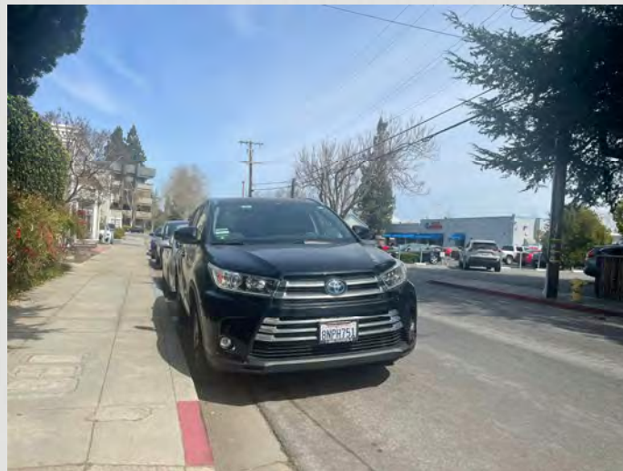
Looking left at 3' beyond the edge of the driveway

Inadequate line of sight as drivers turn onto Roble Avenue when they exit the driveway