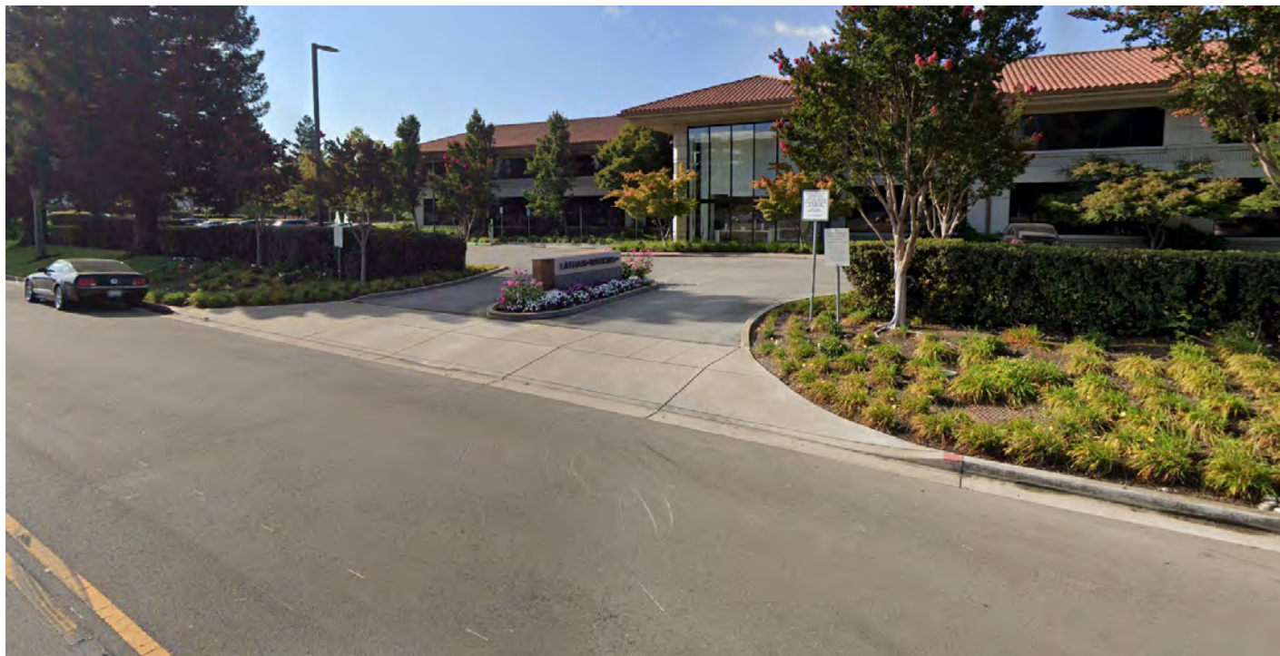
Existing conditions at 140 Scott Drive