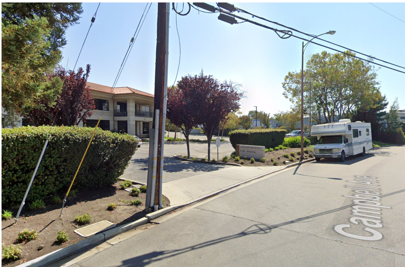
Existing conditions at 120 Scott Drive