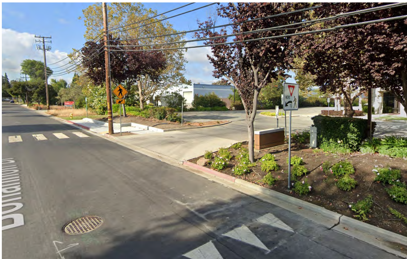
Existing conditions at 160 Scott Drive