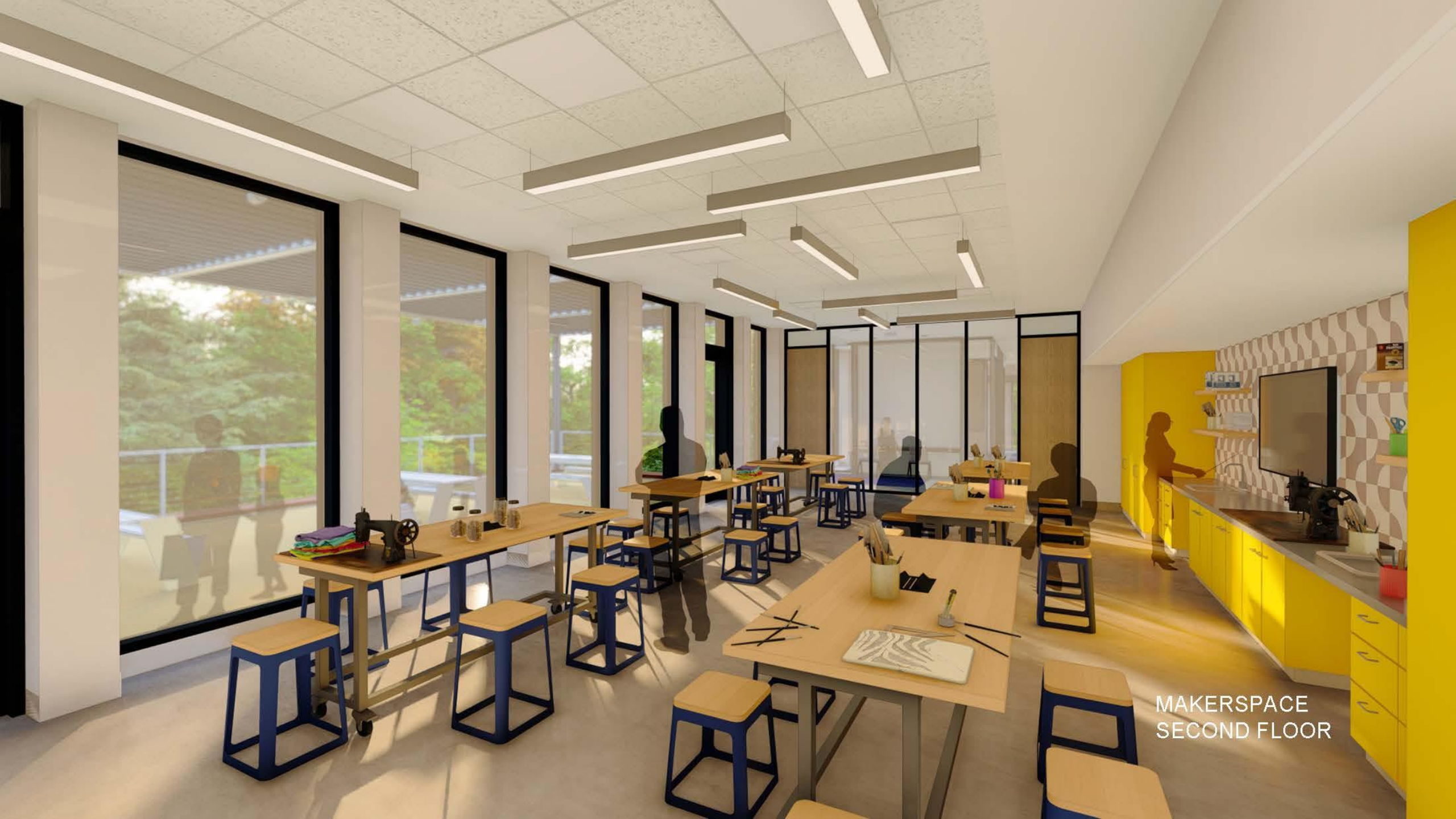
MAKERSPACE SECOND FLOOR