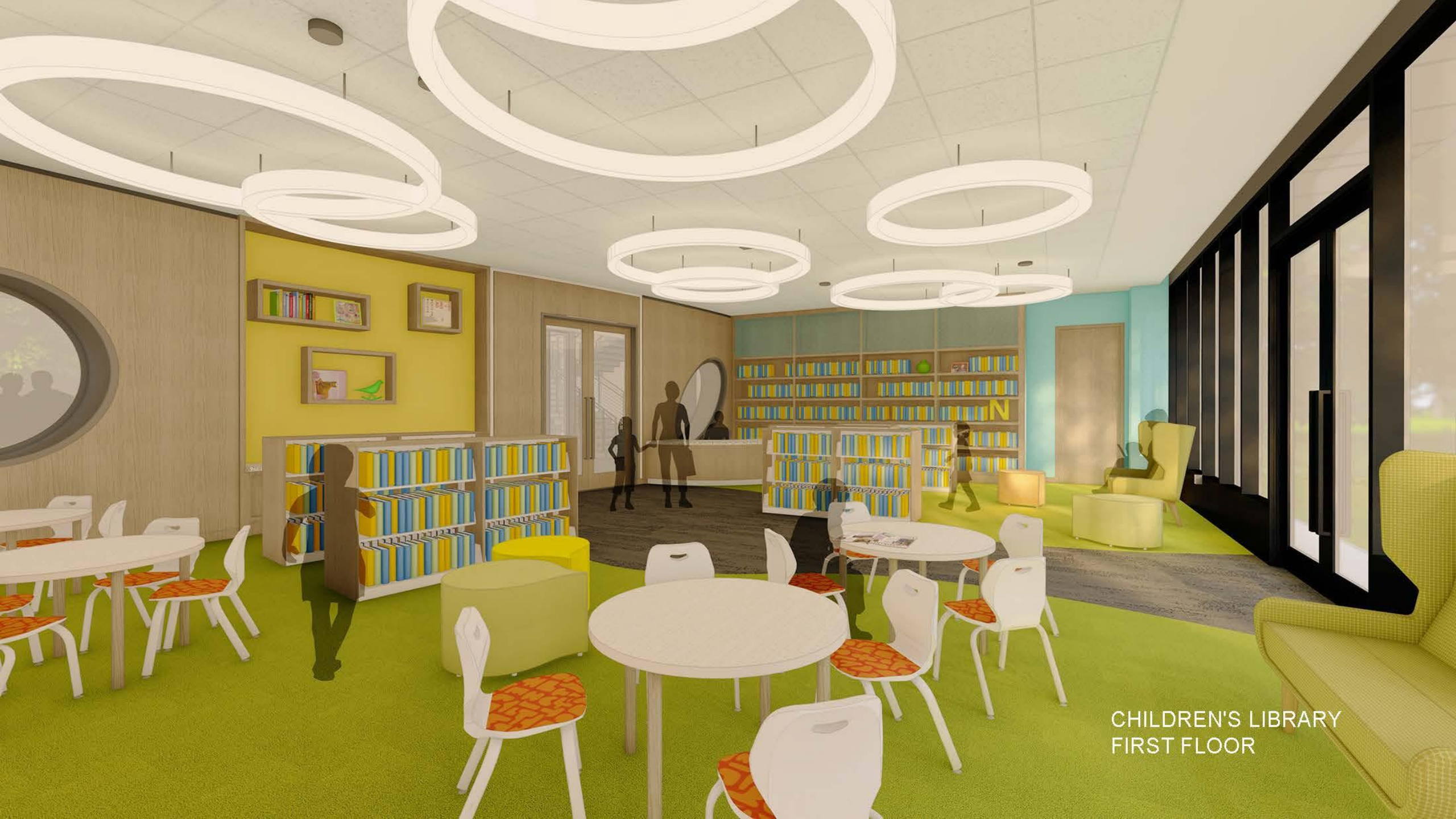
CHILDREN'S LIBRARY FIRST FLOOR