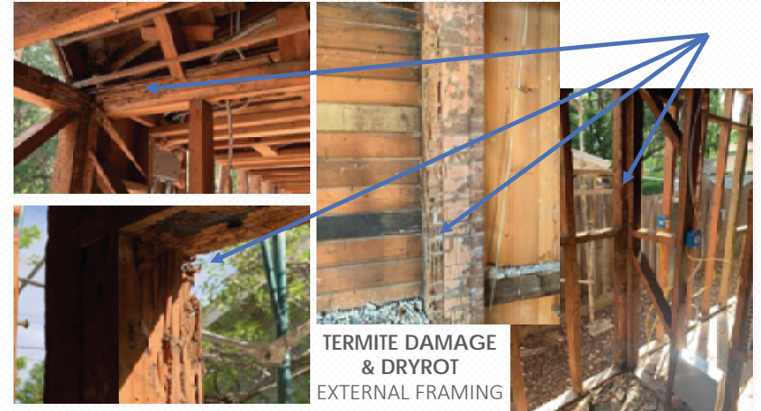
TERMITE DAMAGE & DRYROT EXTERNAL FRAMING