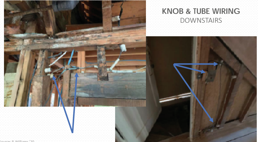
KNOB & TUBE WIRING DOWNSTAIRS