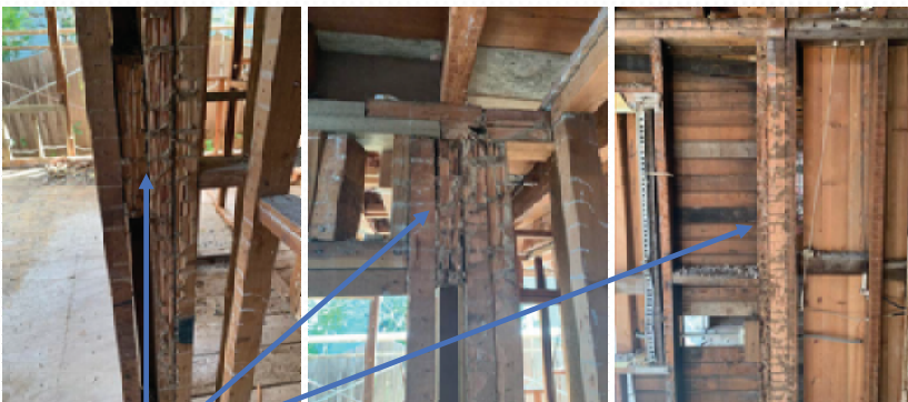
TERMITE DAMAGE & DRYROT INTERNAL FRAMING