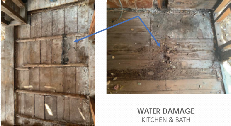
WATER DAMAGE KITCHEN & BATH