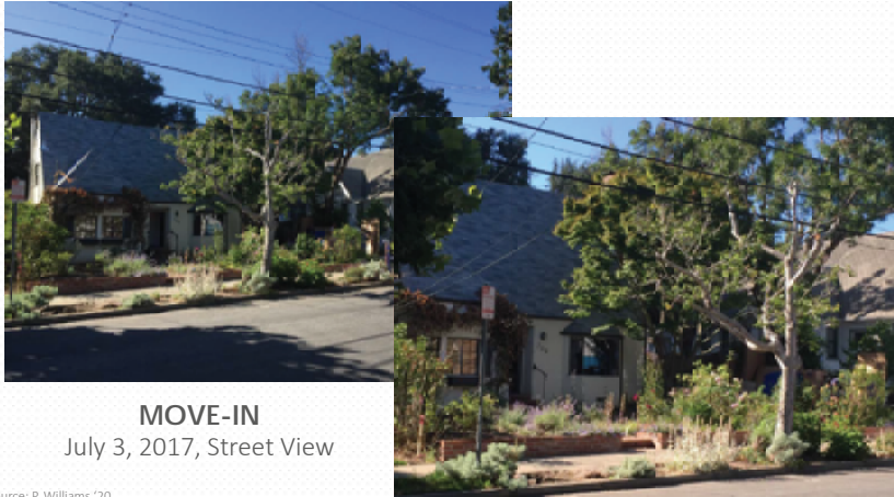
MOVE-IN July 3, 2017, Street View