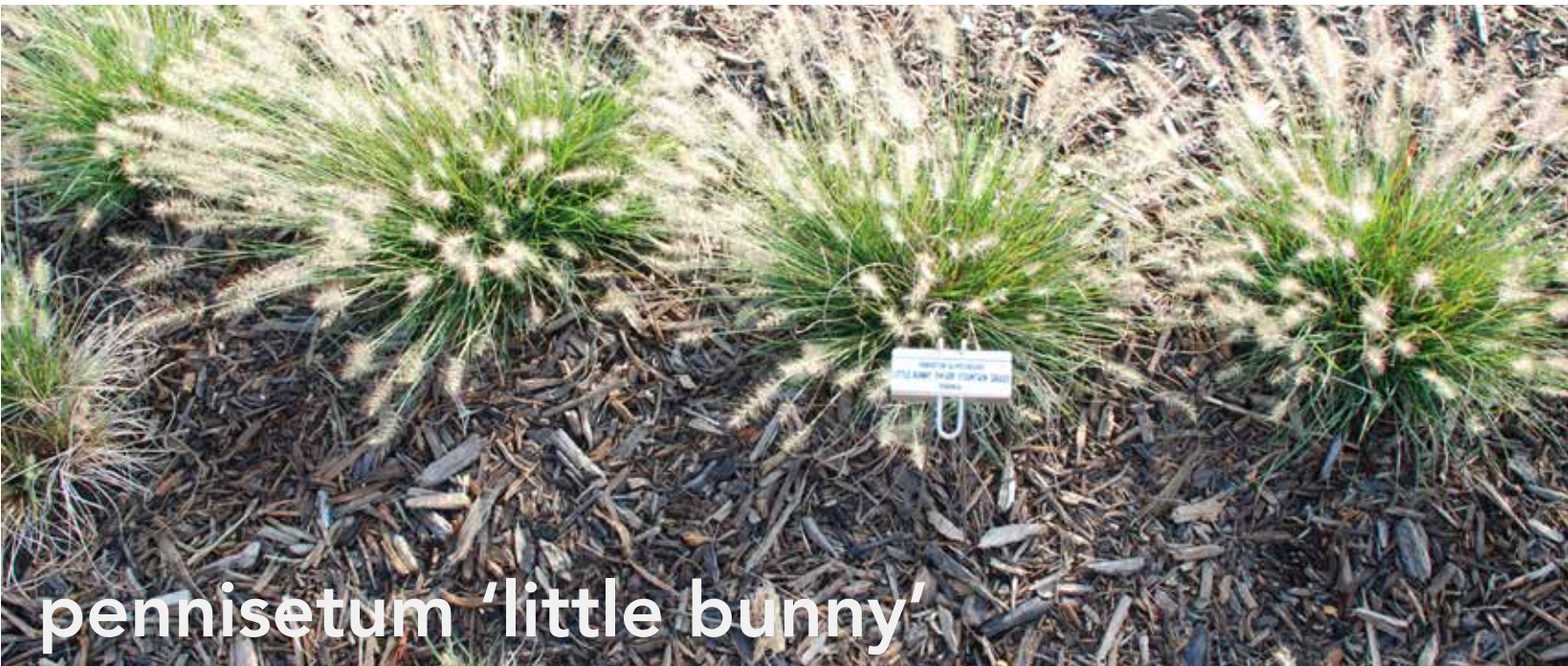
pennisetum 'little bunny'