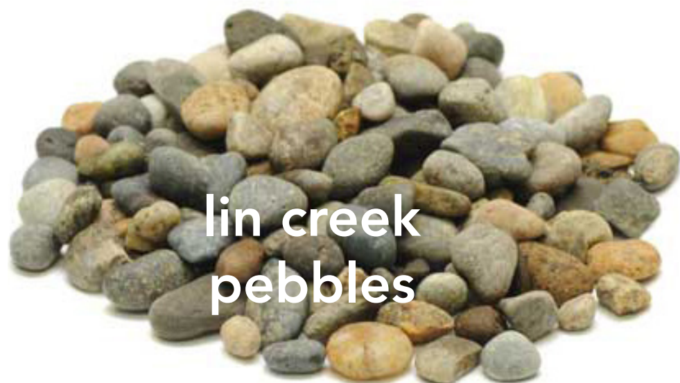
lin creek pebbles