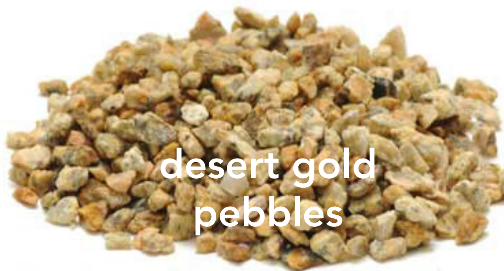
desert gold pebbles