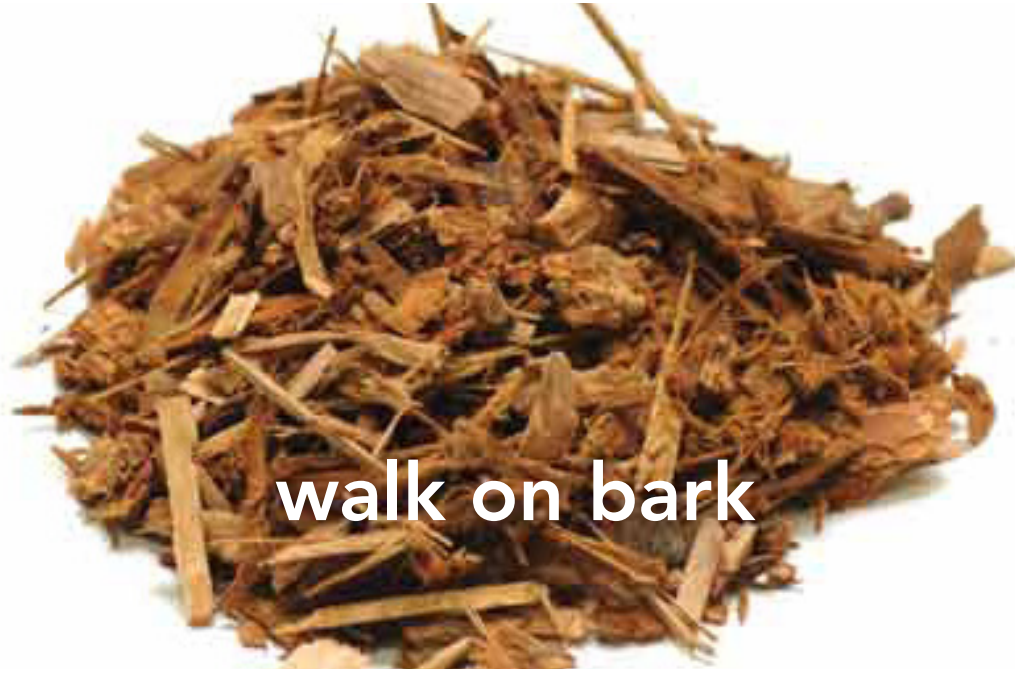
walk on bark