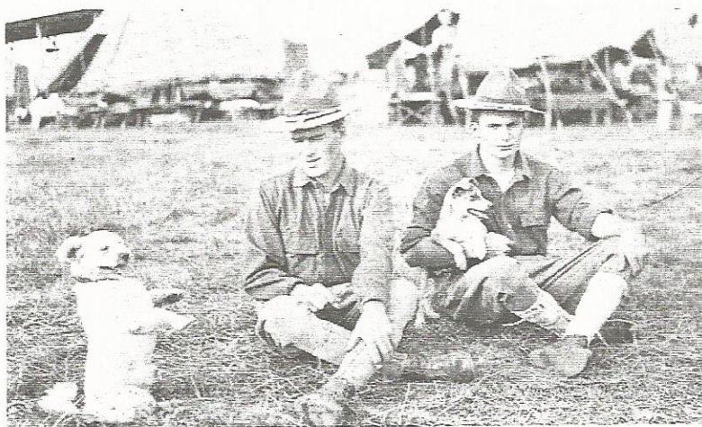
Few World War I recruits were as comfortable in basic training.

Menlo Park was chosen as a training facility because of the similarity of its terrain to the battlefields of France. In the hills west of town, trainees built foxholes and dug trenches while practicing