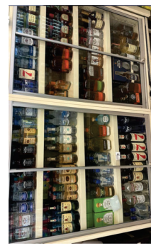
Example of locked spirits display case

7-ELEVEN STORE #14331 525 OAK GROVE STREET MENLO PARK, CA. 94025 Prepared by J. ROGERS Drawn by G. SULLIVAN Scale 3/16" = 1'-0" Date 10/05/2006 Sheet 1 of 1 ROYSTON Drawing Number 14331FP