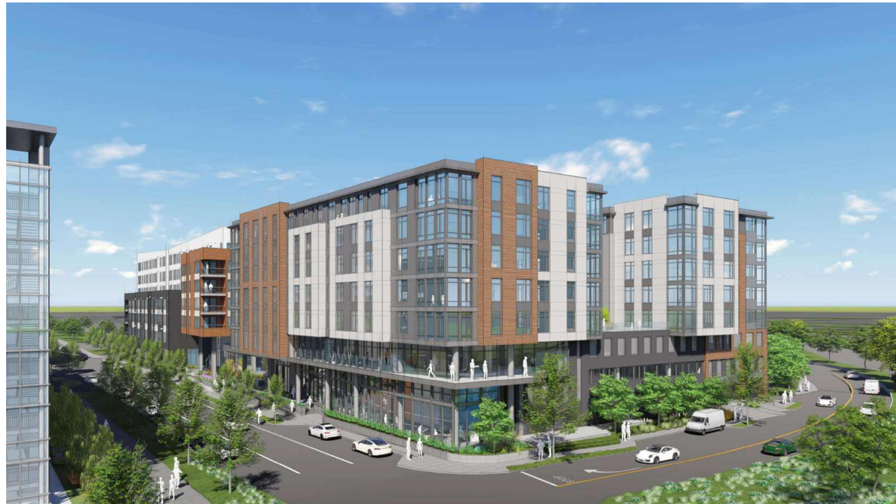
AERIAL VIEW FROM MARSH ROAD