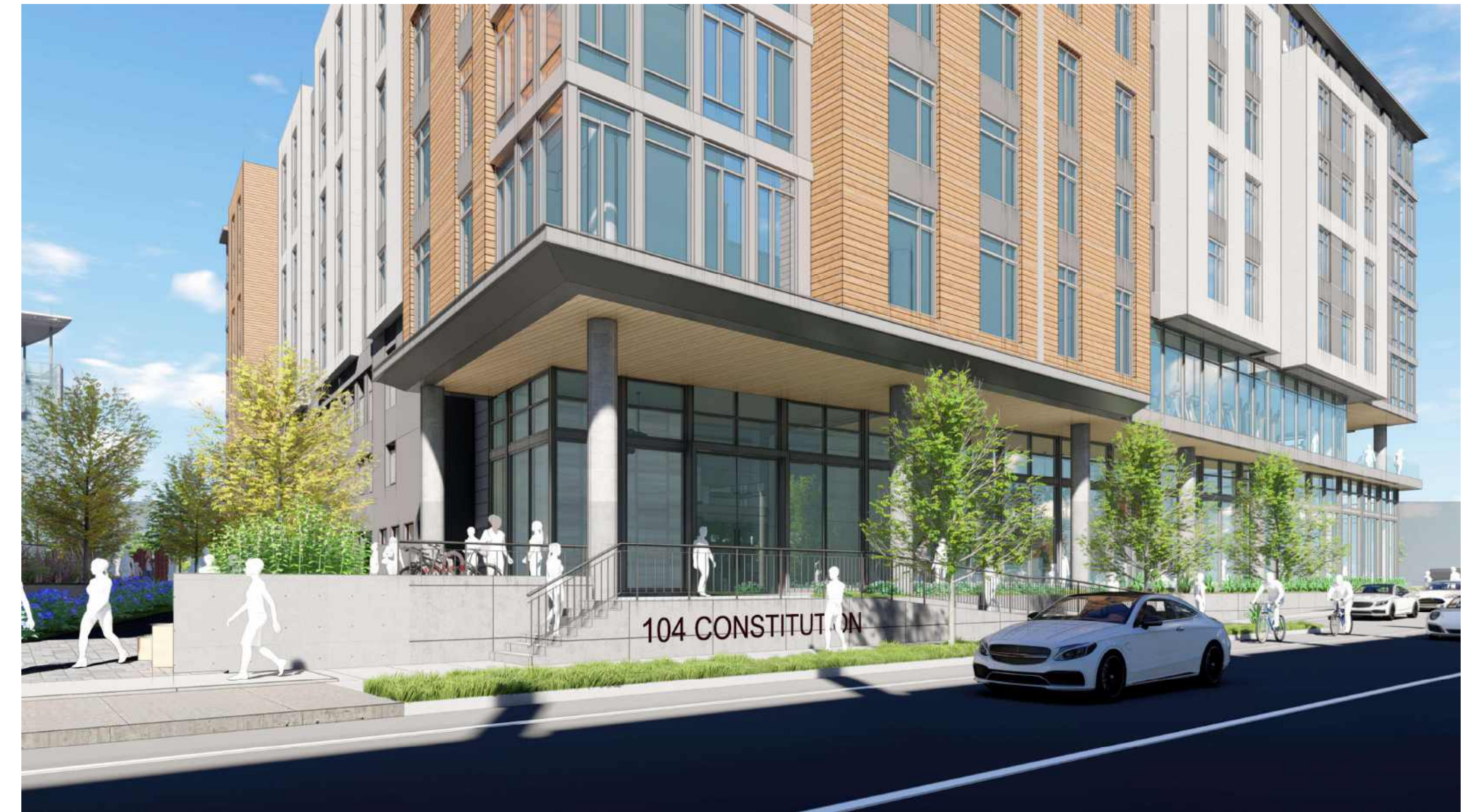
VIEW OF BUILDING ENTRY ON CONSTITUTION DRIVE