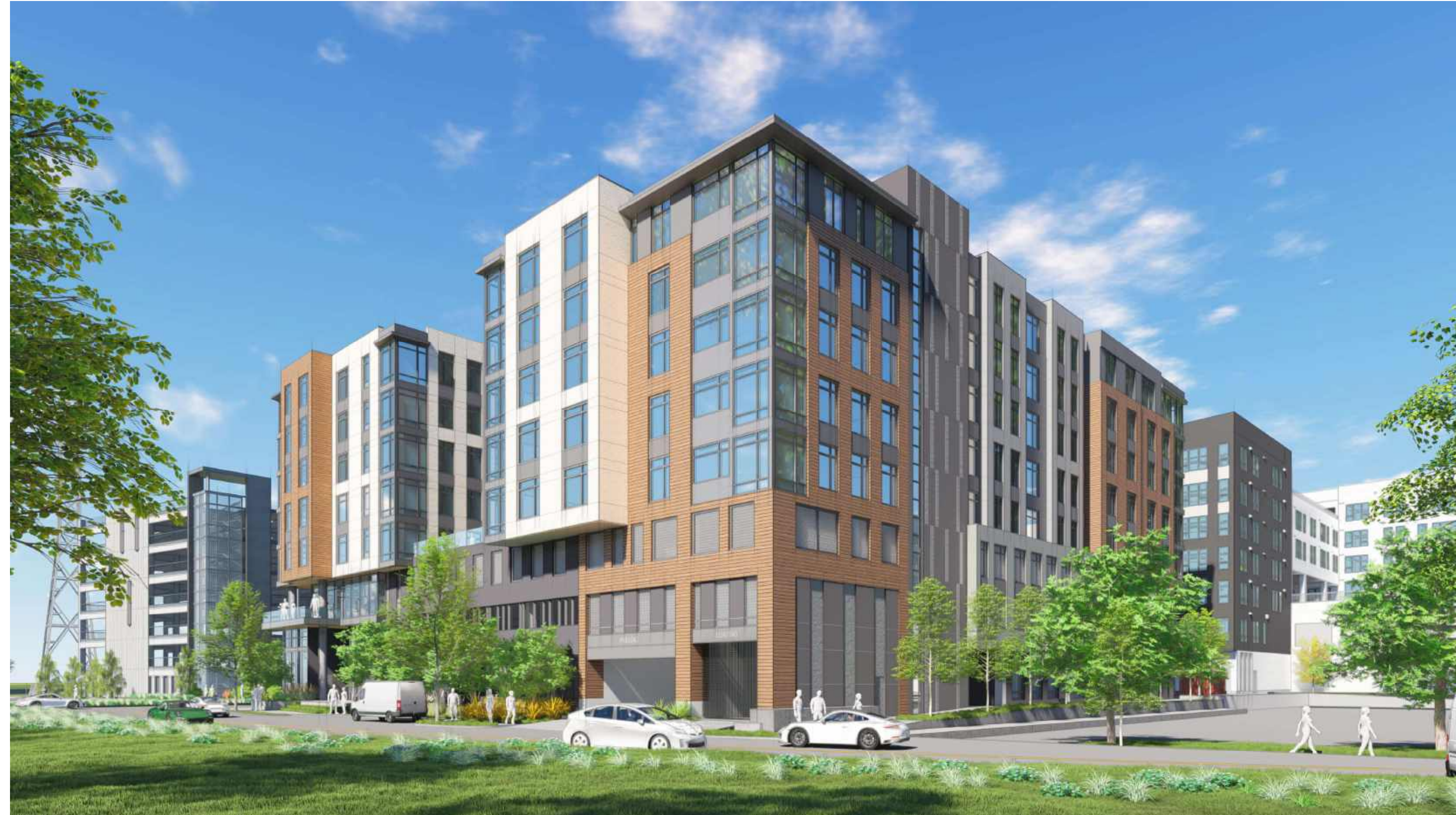
VIEW FROM INDEPENDENCE DRIVE