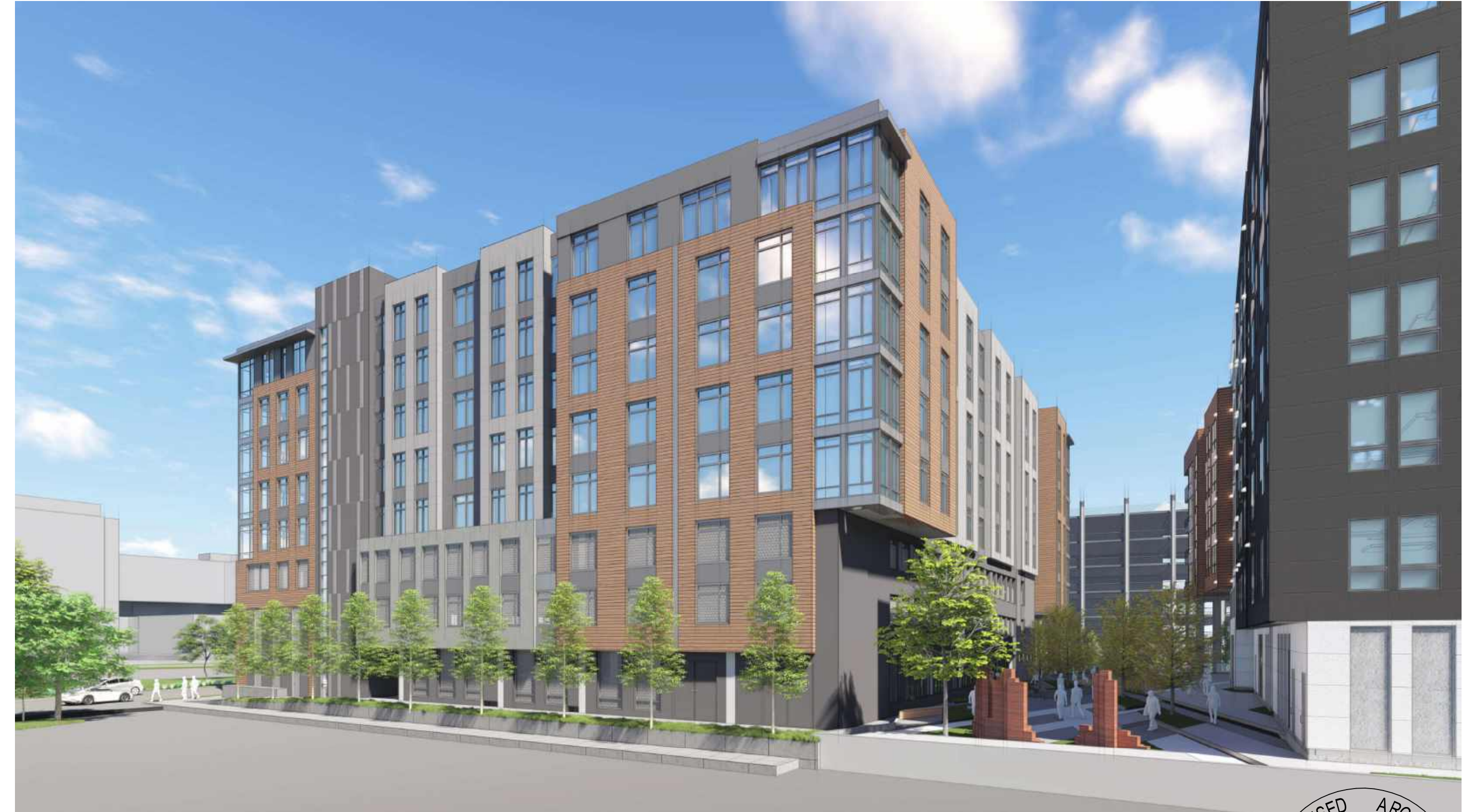
VIEW OF SOUTH EAST CORNER OF BUILDING AND CENTRAL PLAZA LOOKING NORTH