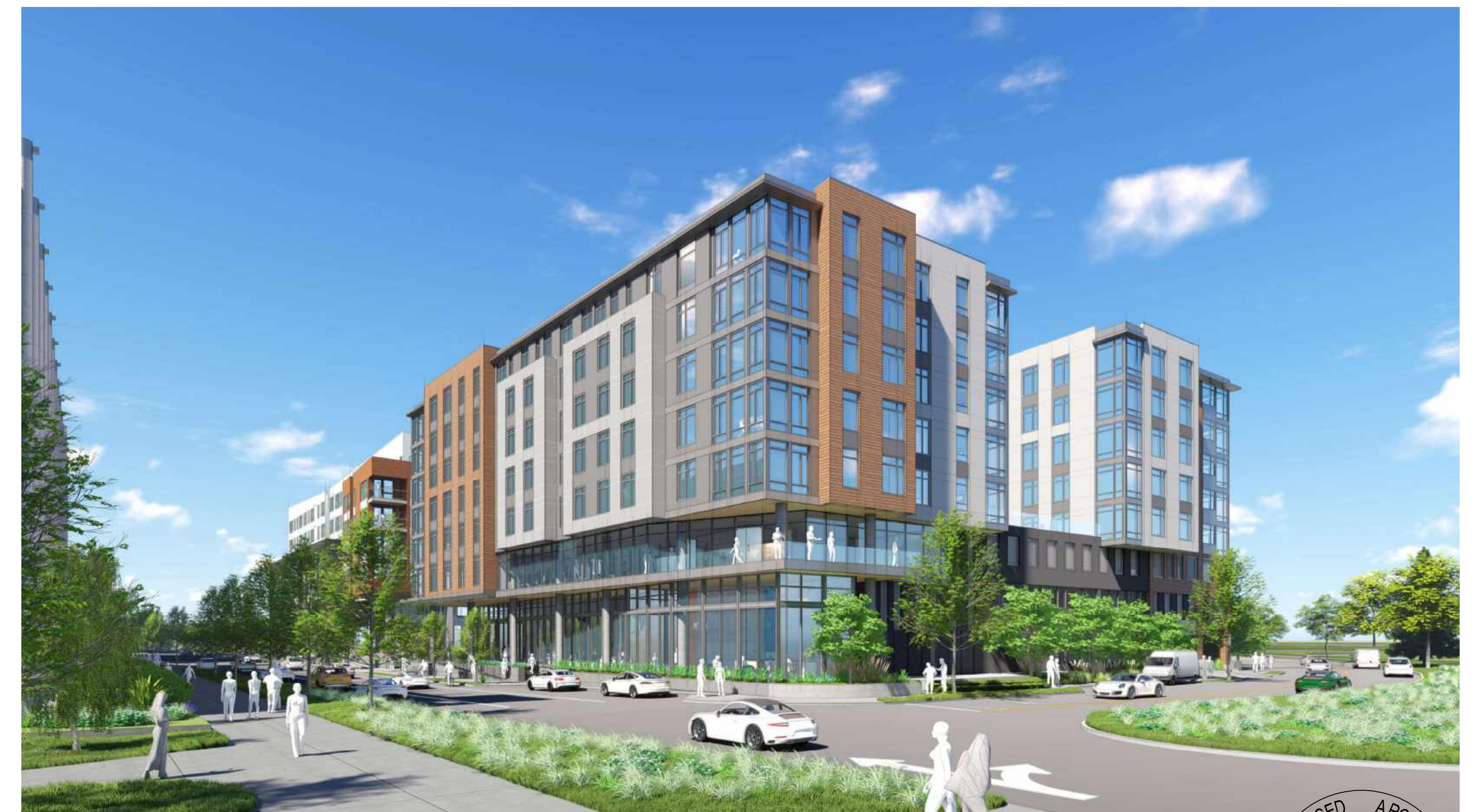
VIEW FROM MARSH ROAD