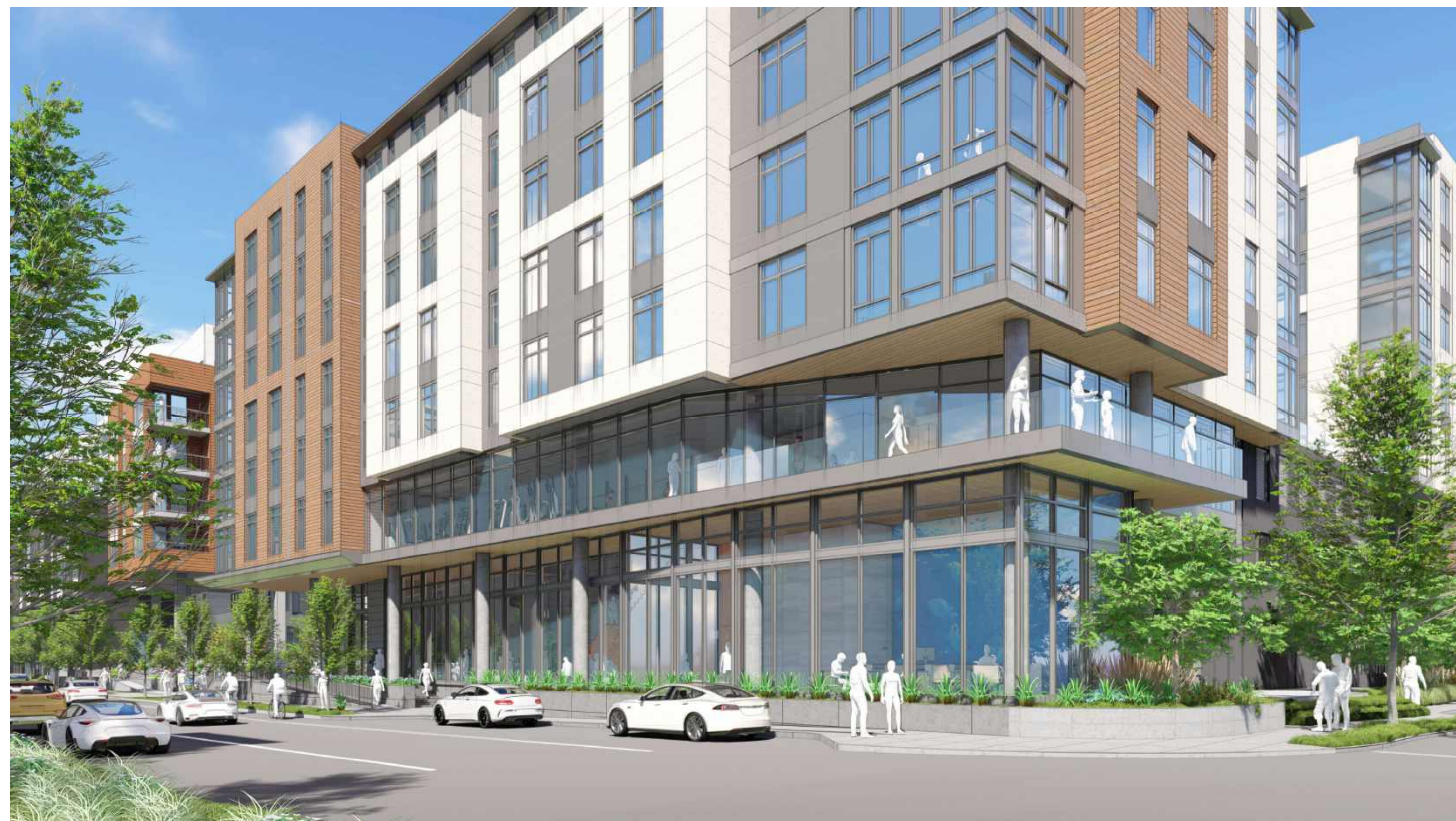
VIEW OF STREET CORNER