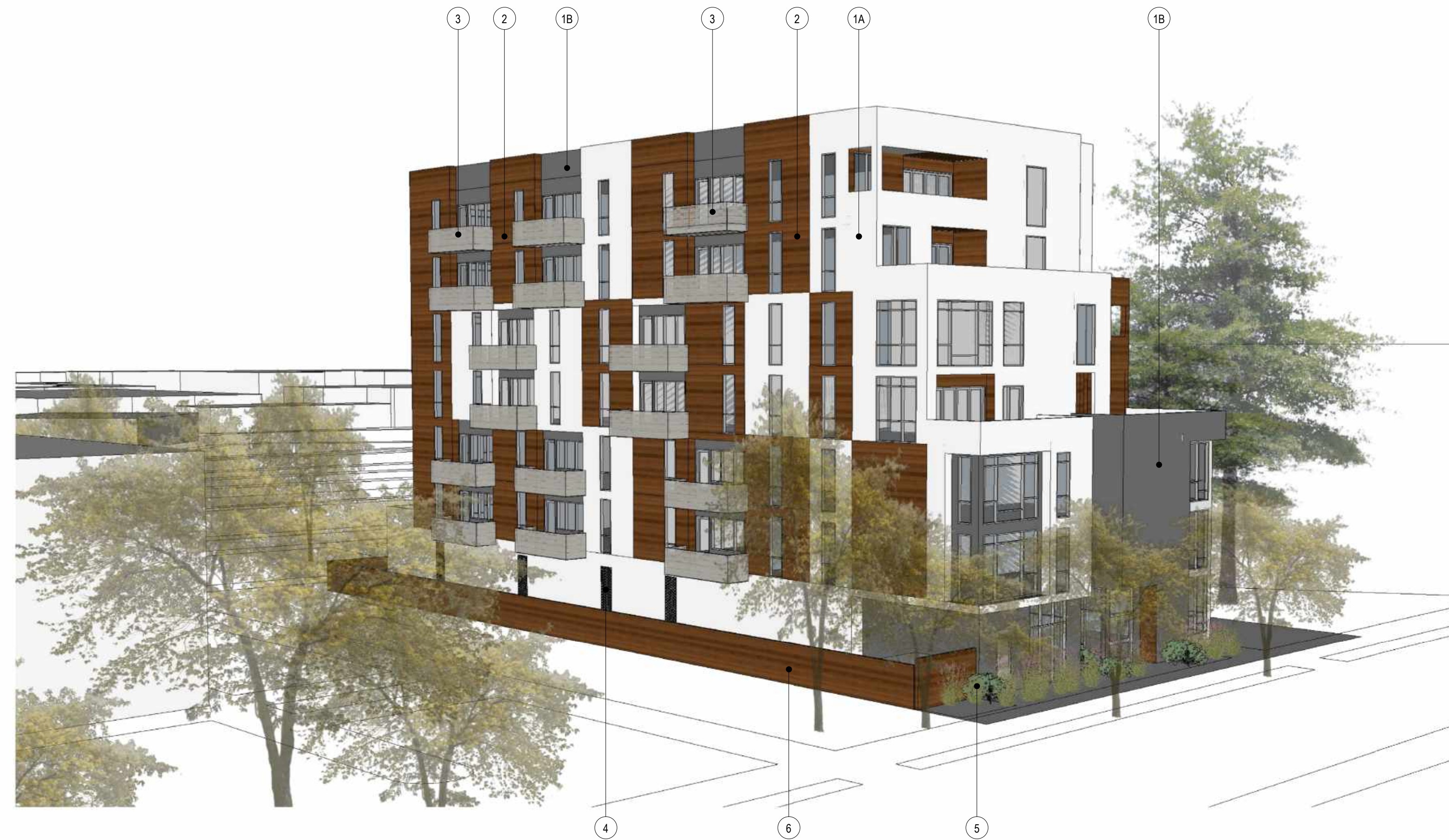
2 VIEW OF WEST AND NORTH FACADES