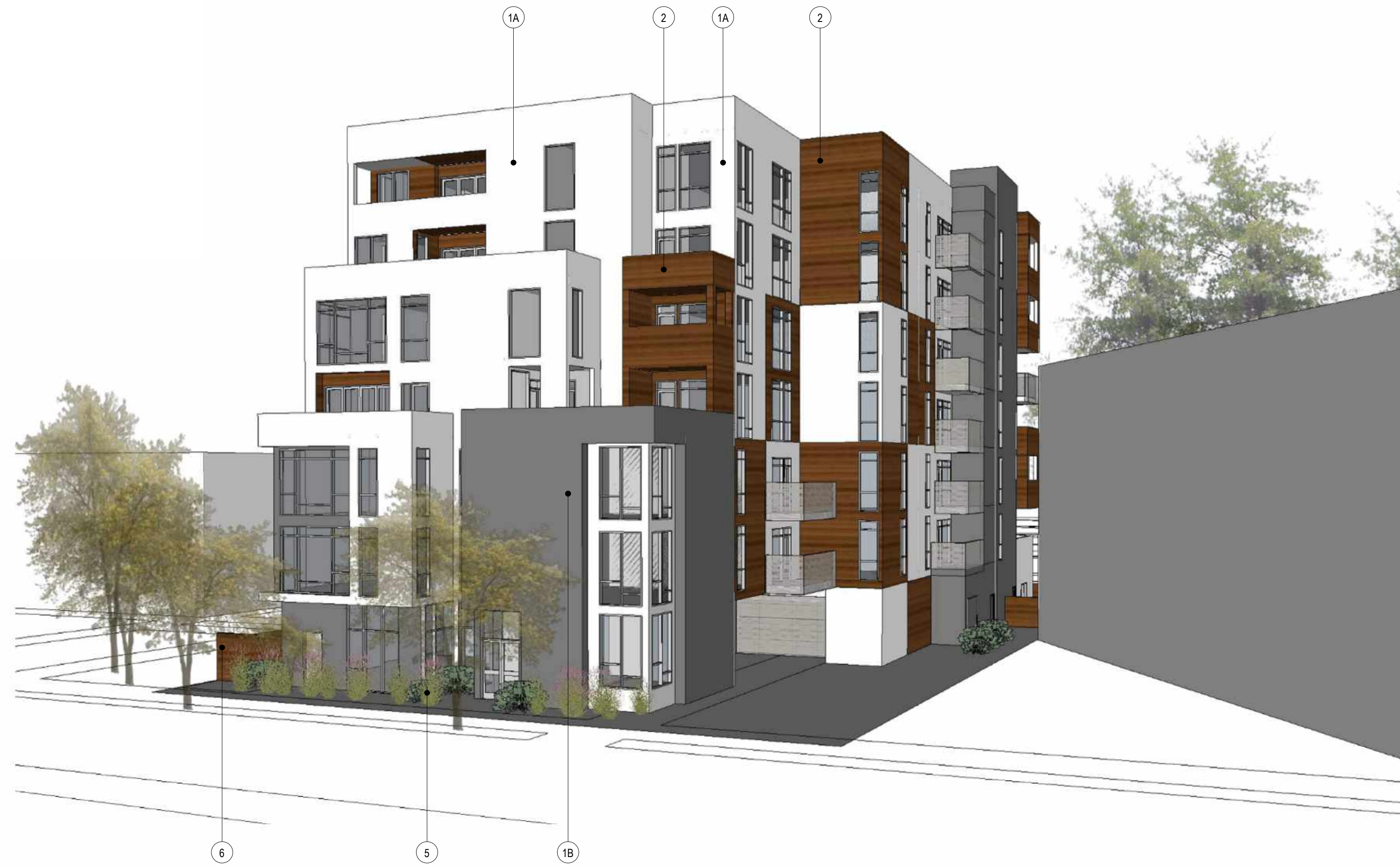
1 VIEW OF WEST AND SOUTH FACADES