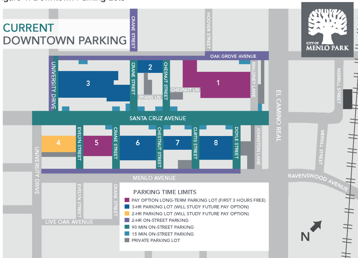
Figure 1. Downtown Parking Lots 2

This report references directions using the same geographic conventions as the Specific Plan and considers Santa Cruz Avenue as having an east-west orientation. Figure 1 shows the locations of the downtown parking lots, with parking plazas north of Santa Cruz Avenue numbered 1 through 3 (north to south), and parking plazas south of Santa Cruz Avenue numbered 4 through 8 (south to north).