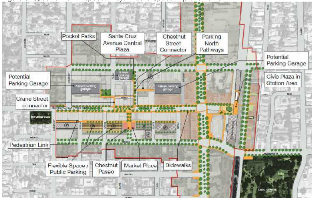
Figure 3. Specific Plan Proposed Major Public Space Improvements