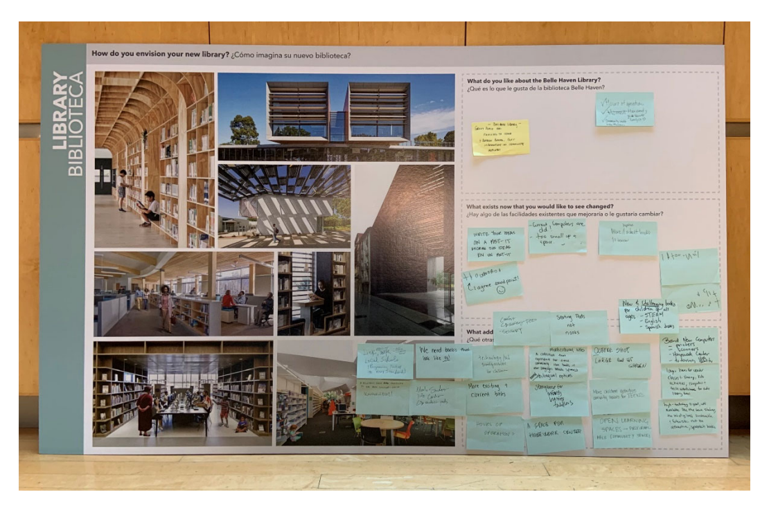
Question #1 - What do you like about the Belle Haven Library?

• See ideas from the community outlined below.