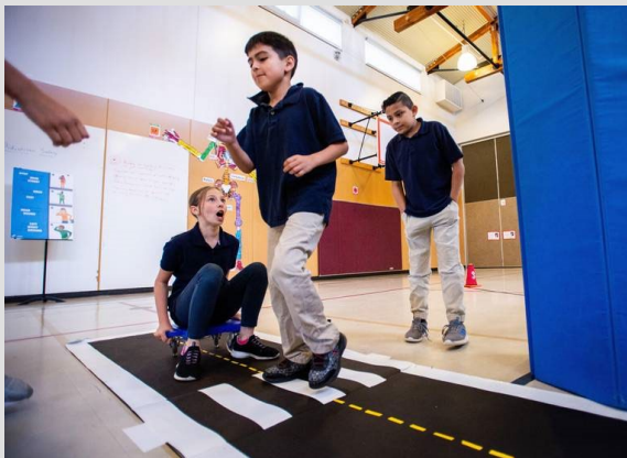
City of Tacoma Pedestrian Safety Curriculum, The News Tribunes , June 2019