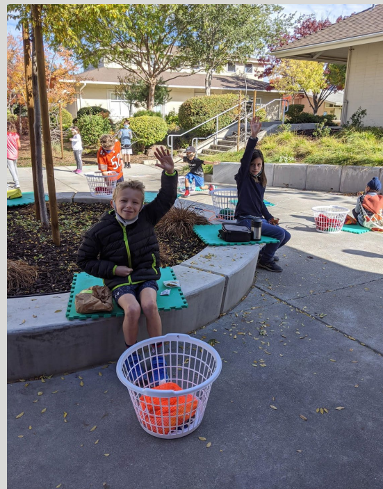
Snack and Lunch at Las Lomitas