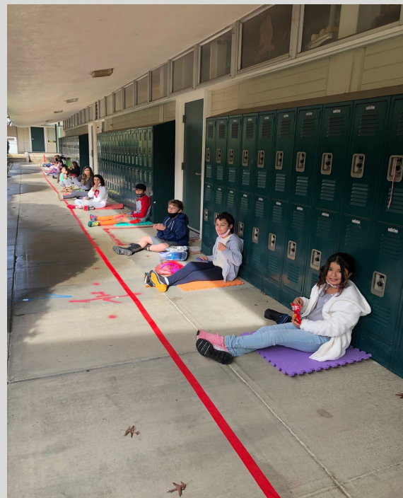
Recess Zones for each cohort at La Entrada