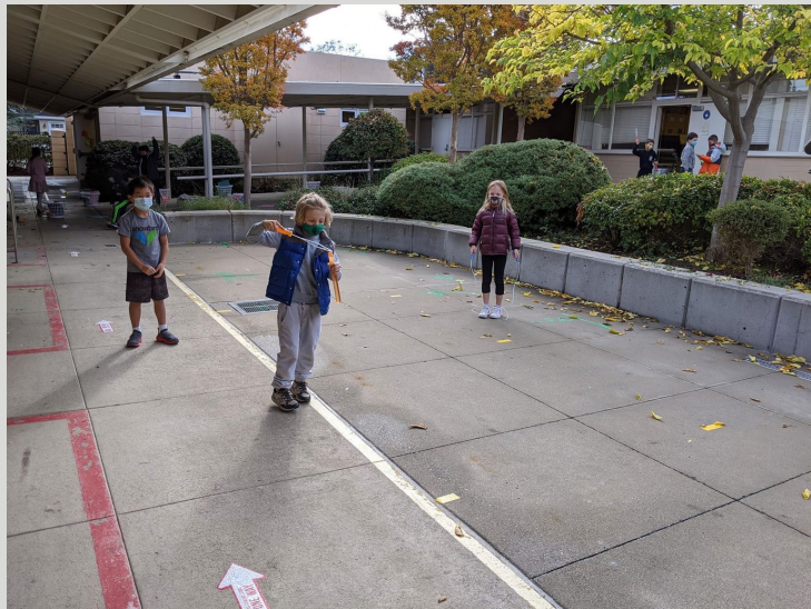
Play time at Las Lomitas