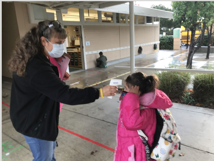
Las Lomitas ES Health Check