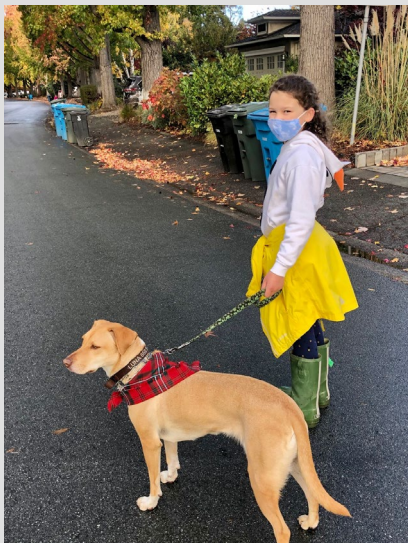
Ruby Bridges Walk to School Day 2020