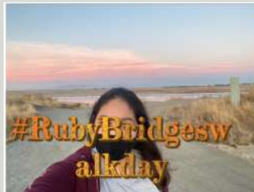
Ruby Bridges Walk to School Day at TIDE Academy, November 2020