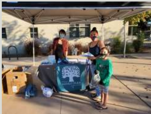
Helmet Giveaways at Belle Haven School, October 2020