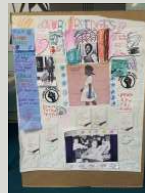
Ruby Bridges Walk to School Day at Laurel School, November 2020