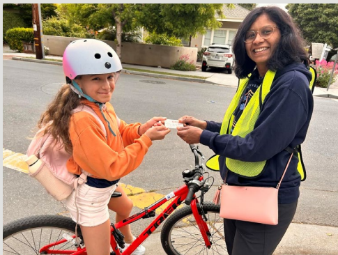
Laurel Operation Bike Safety