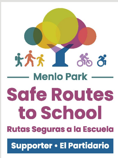
SRTS Supporter Sticker

SRTS Supporter Program – part of the SMCOE School Travel Fellowship (2023)