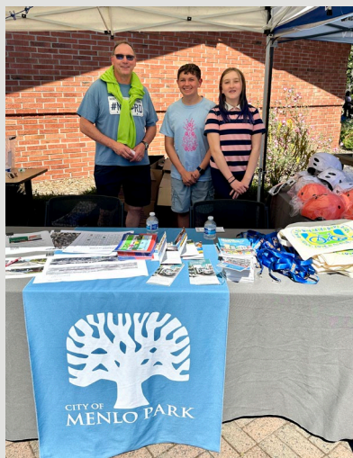
Hillview students helped with the SRTS station.