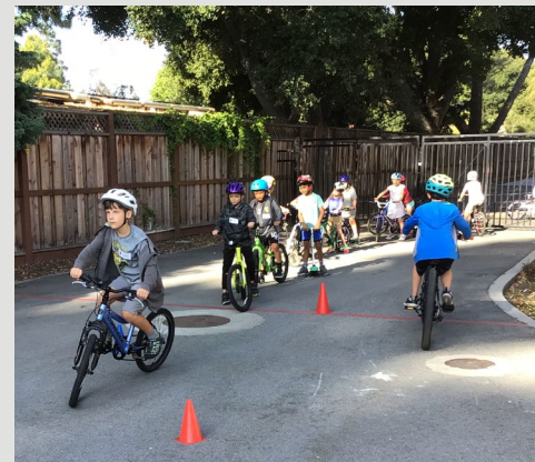
Laurel Bike Rodeo