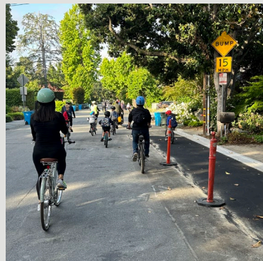
Oak Knoll Bike Bus