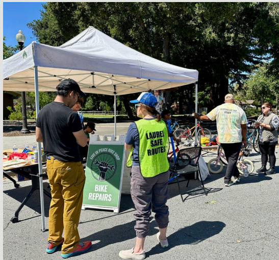
Live in Peace pop-up bike repair station.