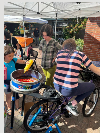
Bike spin art.