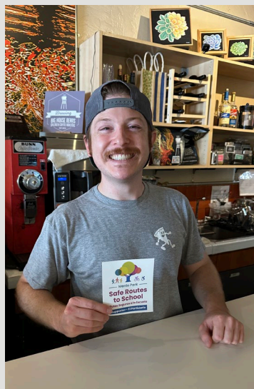
6 businesses part of the program