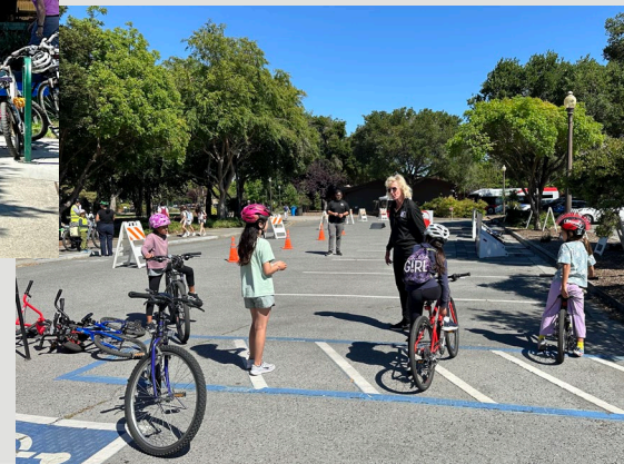
Right: Safe Moves Bike Rodeo taught biking safety to 35 students.